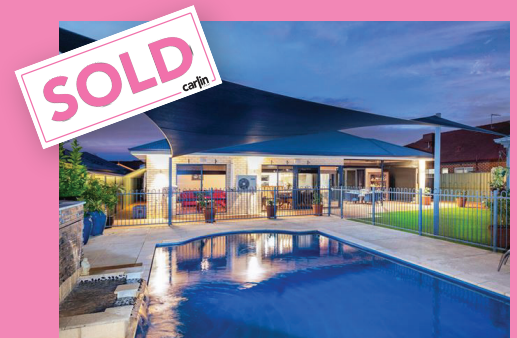
9 PINDAN ELBOW, ATWELL