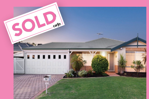
26 MOSEDALE RETREAT, ATWELL