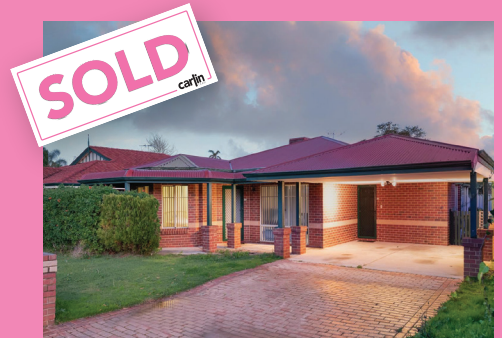
12 SHADWELL RETREAT, ATWELL